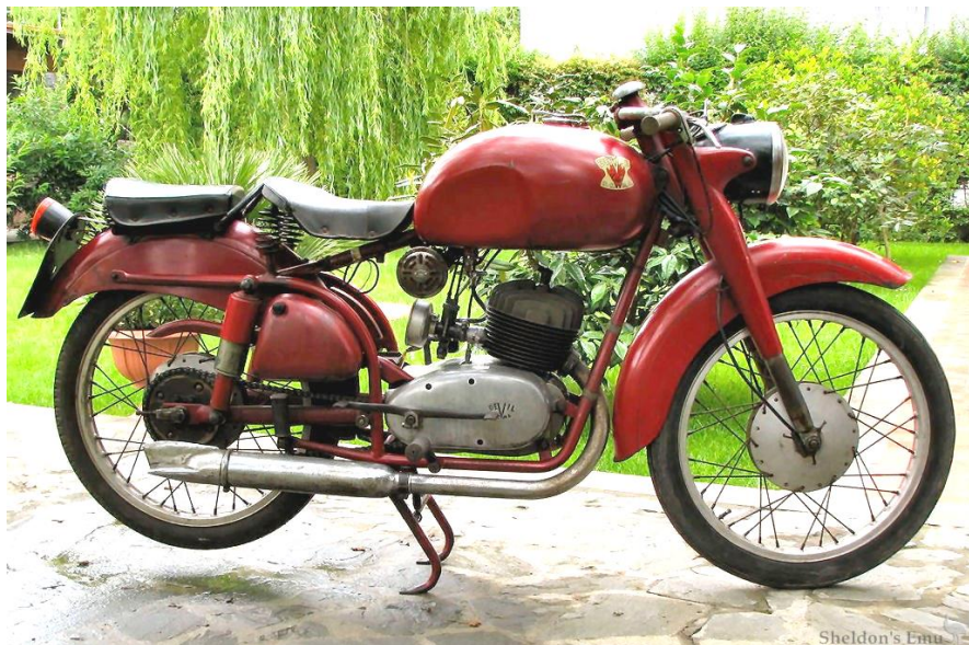
The Devil Motorcycle