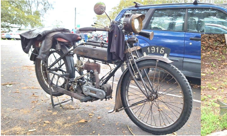
Sunday 24 Feb Girder Fork Hub Run