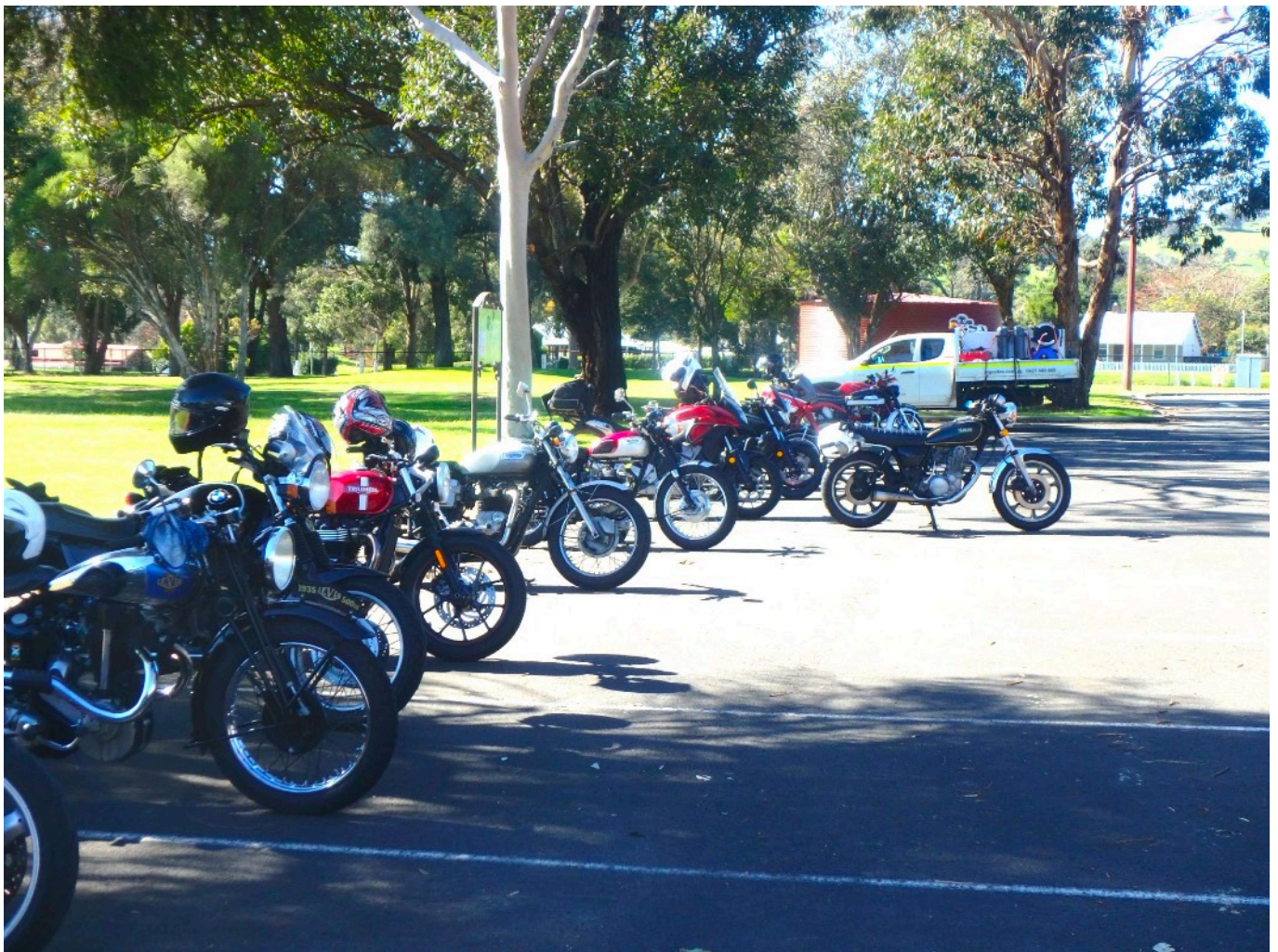
BUNBURY TORTOISE RIDE