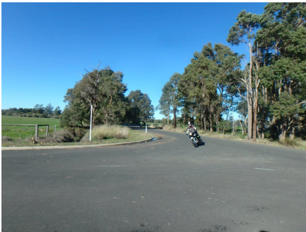
BUNBURY TORTOISE RIDE