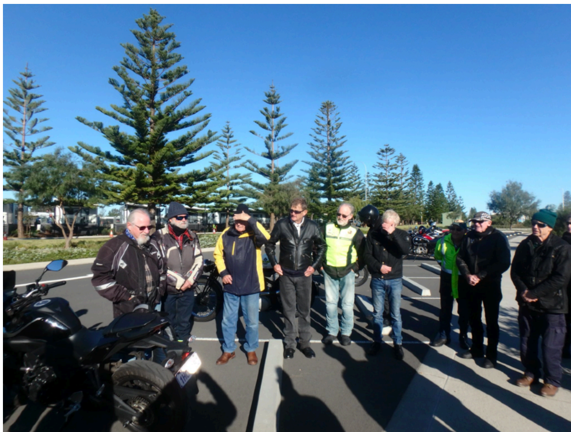
BUNBURY TORTOISE RIDE