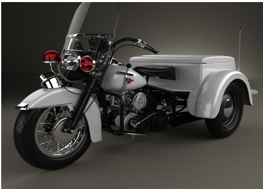
H-D 1958 Servi-Car 750cc S/V