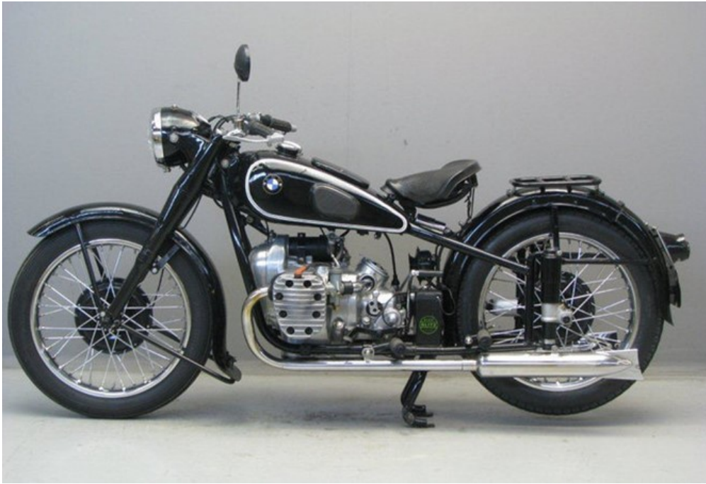
BMW R71 1945 750cc S/V