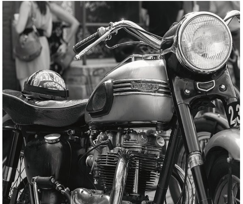
Triumph 1959 Tiger