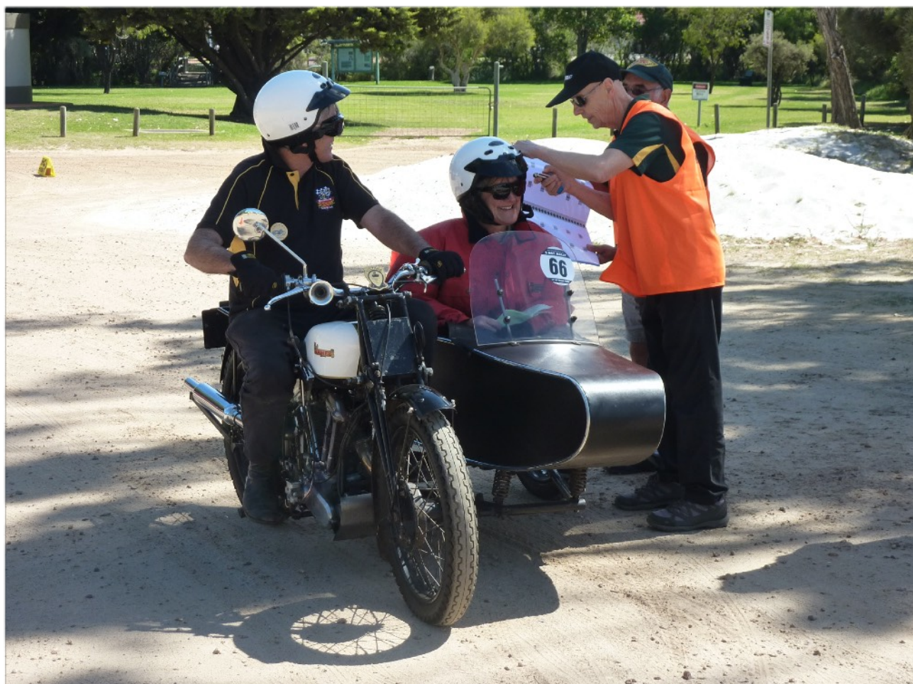
TWO DAY RALLY 2017

As you can see we don't have any letters to the editor this month. If you would like to have your say here please email editor@ihc.asn.au or via post to Editor, Indian Harley Club (Bunbury) Inc., PO Box 317, Bunbury 6231.