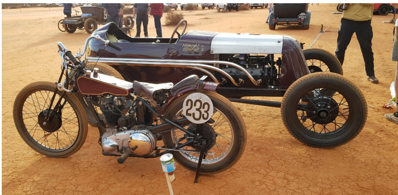
BENJAMIN STRATTON'S 350 ARIEL AND JORDAN BENNETT'S V8 FORD SPECIAL TRAVELLED UP TO PERKO FROM DUNSBOROUGH. THIS PIC WAS OBVIOUSLY TAKEN ON THE FIRST DAY.