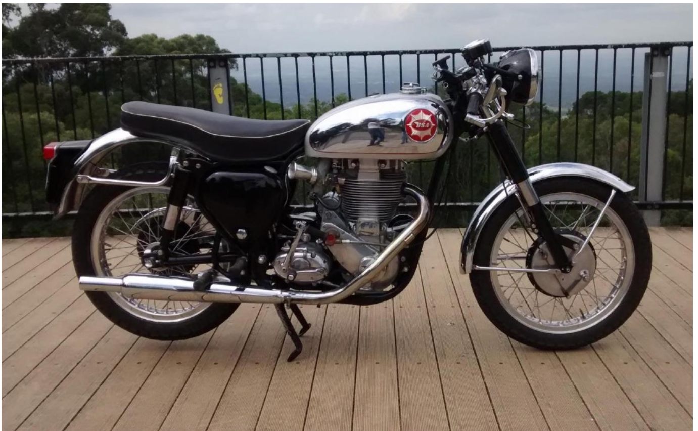
BSA 500CC CLUBMAN GOLD STAR