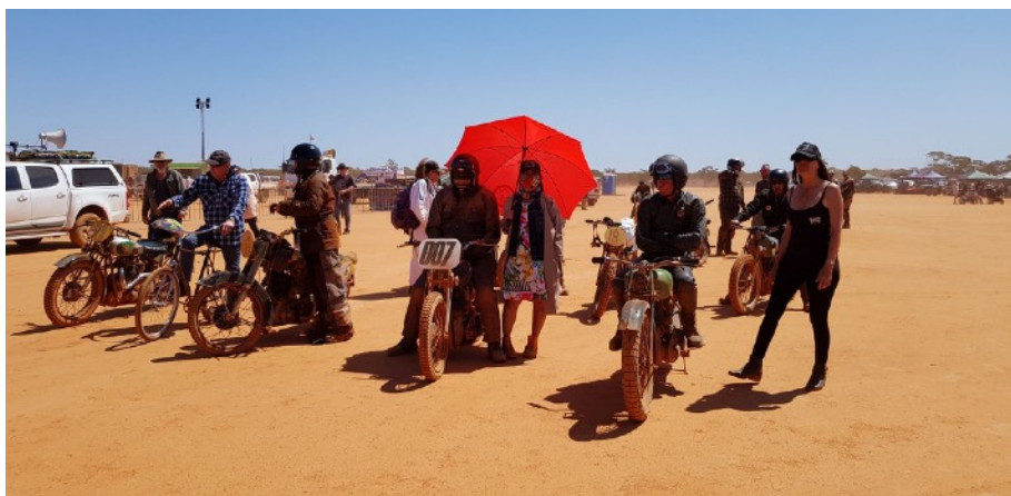
RED DUST REVIVAL