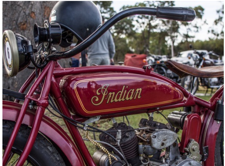
TWO DAY RALLY 2018

To make your magazine more interesting for our members we need your help. Please give some thought to submitting an article to Classic Vibrations to share your experiences riding, restoring or repairing your motorcycle. Any photos also would be appreciated. Also any hints or tips or advice or anything else that may be of interest to our readers. Please send via email to editor@ihc.asn.au or via snail mail to The Editor, Indian Harley Club (Bunbury) Inc., PO Box 317, Bunbury 6231.