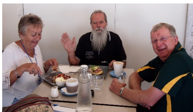
BERTS' BREAKFAST RUN 2016