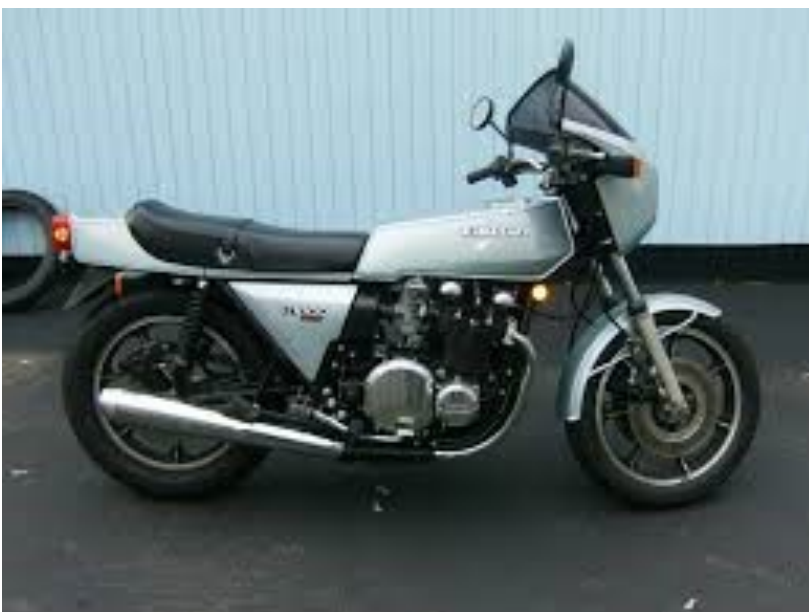
Image of a similar machine not the one for sale.