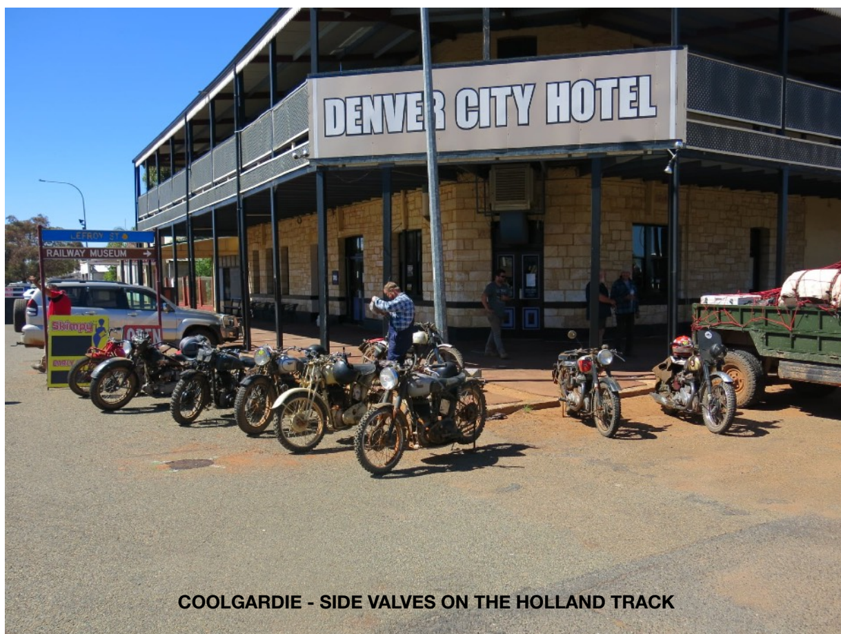
COOLGARDIE - SIDE VALVES ON THE HOLLAND TRACK

Registered by Australia Post Print Post Approved PP631 937/016 If undelivered return to Indian Harley Club (Bunbury) Inc. PO Box 317 Bunbury 6231