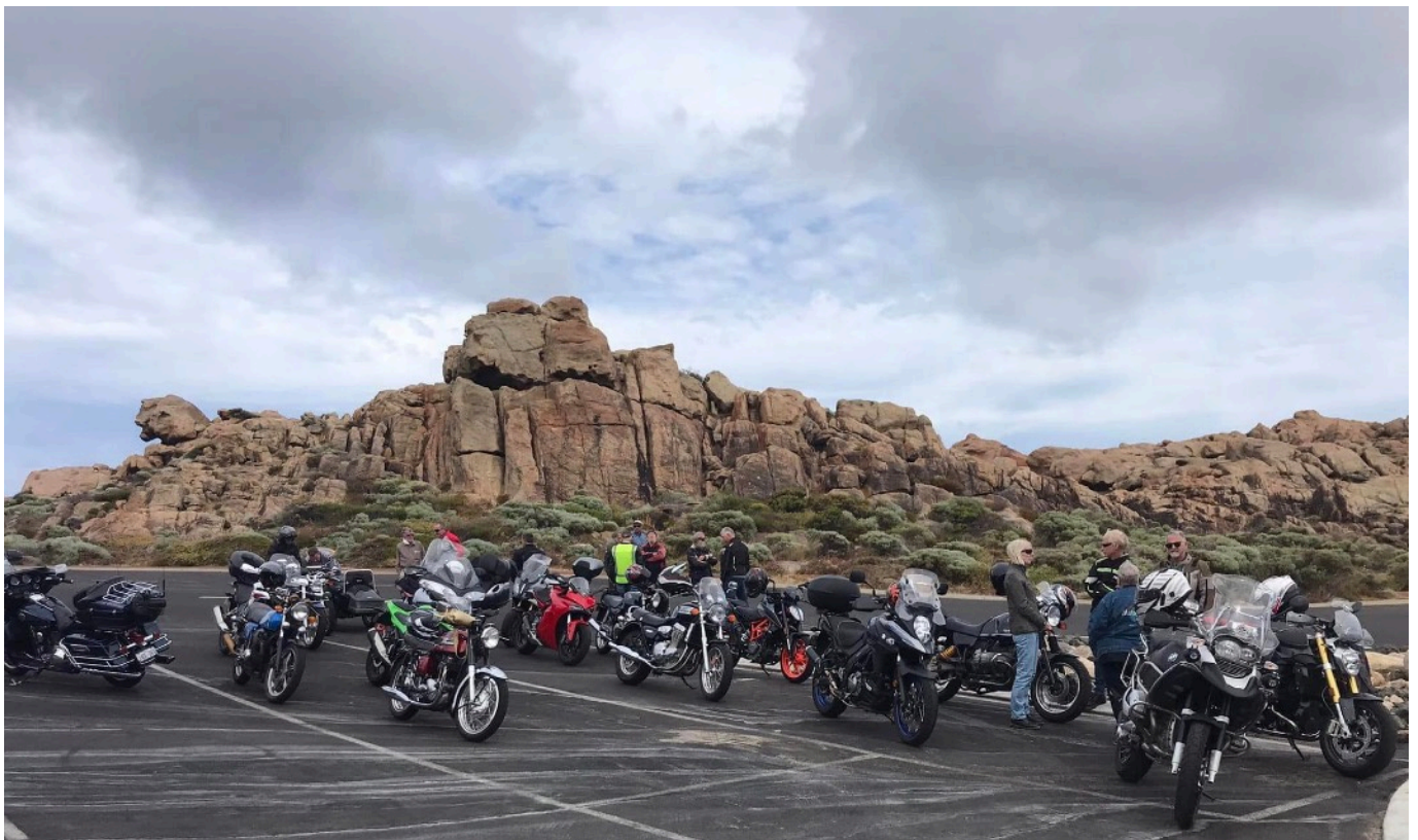
COASTAL RUN 2022