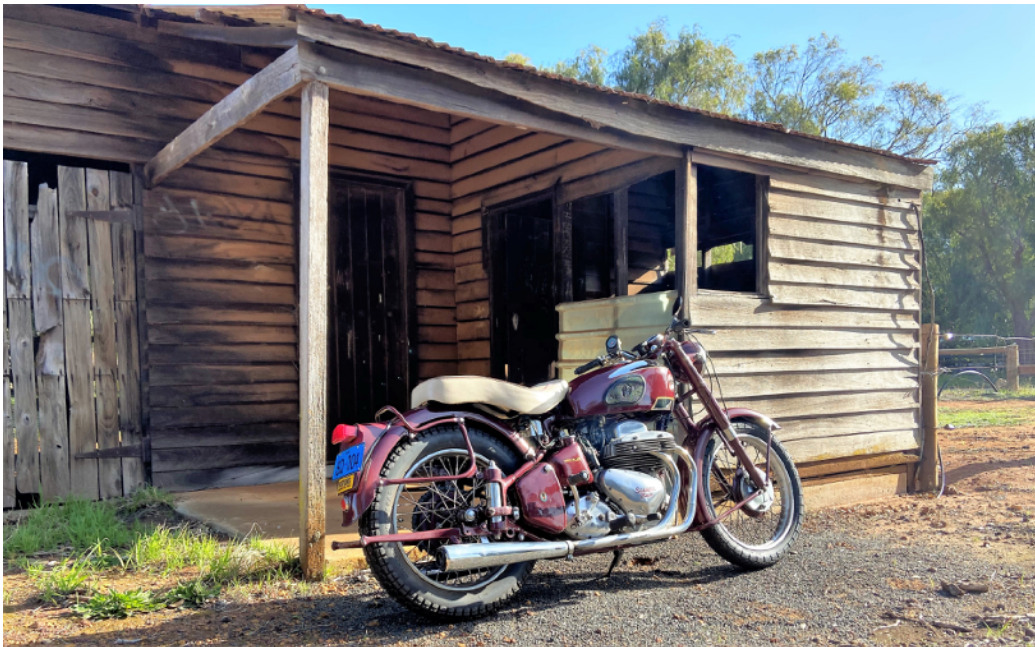
THE AUTHORS SQUARE FOUR OUT AND ABOUT SHORTLY AFTER IT WAS REGISTERED