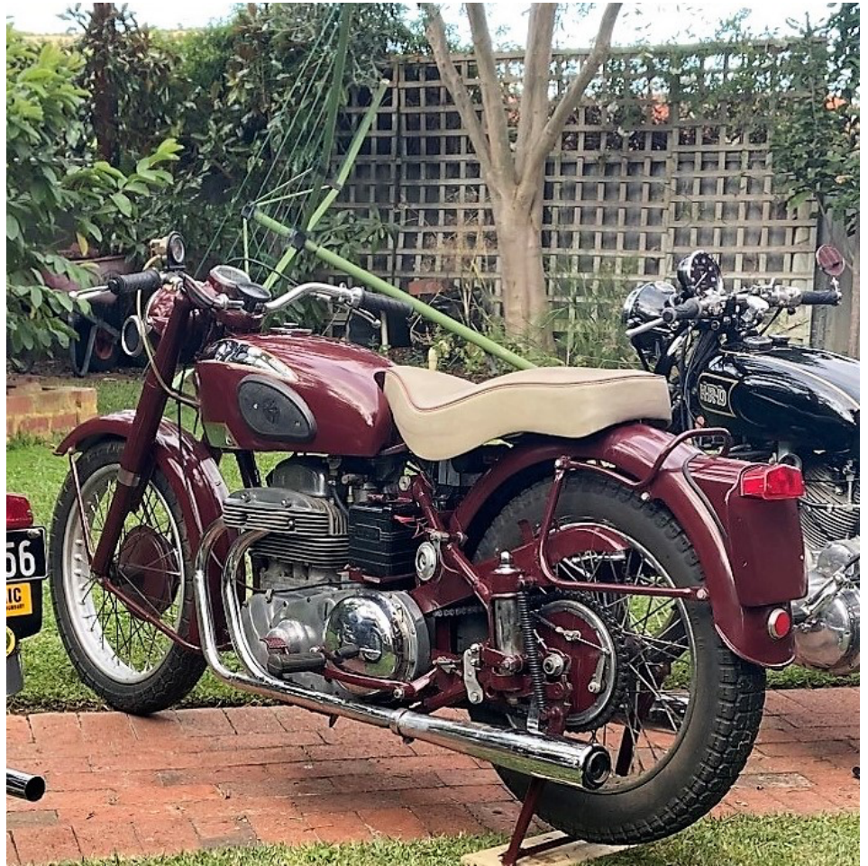
THE UNCOMFORTABLE BANANA SEAT - NO MATCH FOR THE RED HUNTER SPRUNG SADDLE

It never ceases to amaze me how easily the Square Four starts up (you can see how that test ride ended up). Consider a box of four pistons, fed by a single SU carburettor and ignited by a car-style distributor – all from about 70 years ago. The kick is slow and not exactly easy but at some stage of the second or third swing she will fire up with a unique hum and barely perceptible vibrations running through the machine. The sound is exquisite, not unlike that of early Ferrari or Maserati.