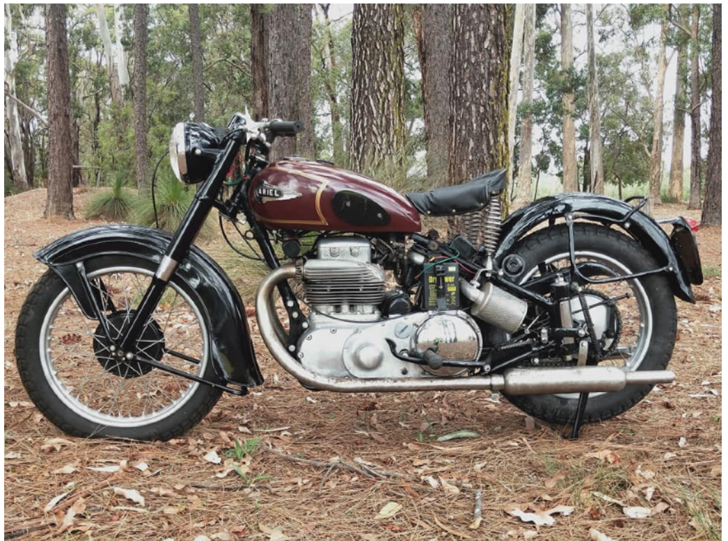
1949 SQUARE FOUR EX WA POLICE. NOTE AFTER MARKET AIR FILTER AND BEEFED UP FRONT MUDGUARD FOR SIREN

Edward Turner was an engineer and influential designer who was at the dawn of the Golden Age of Motorcycling. He designed single-cylinder engines for Ariel and Triumph before introducing his famous Speed Twin into the world back in 1937. Along the way, Turner also had some other revolutionary designs including overhead camshaft engines that were driven by bevel