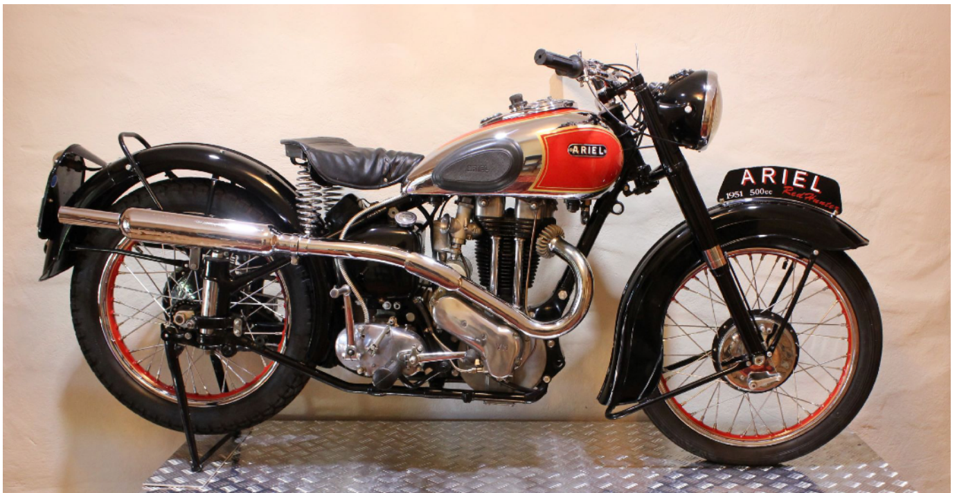
THE AUTHORS RED HUNTER - WITH SPRUNG SADDLE