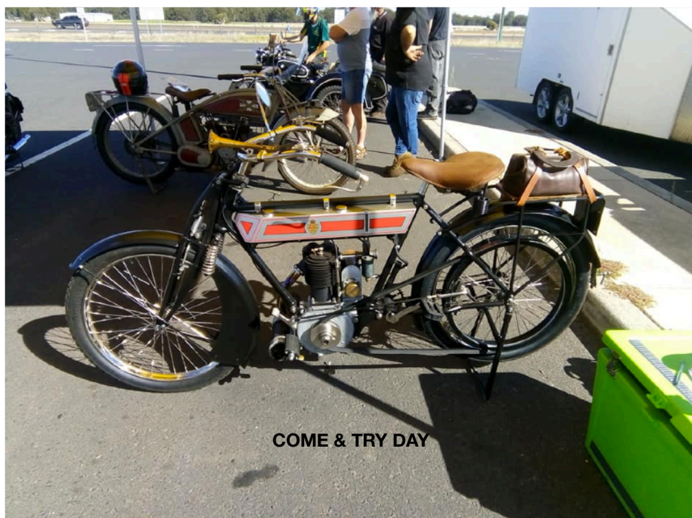
COME & TRY DAY