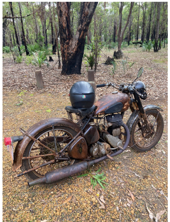
WEBBIE'S MEMORIAL RUN