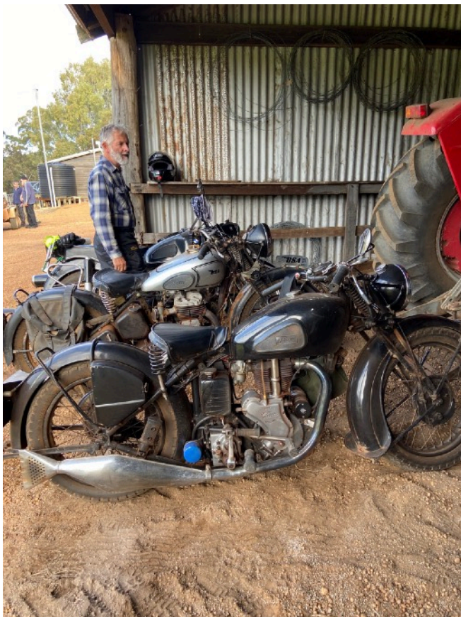
WEBBIE'S MEMORIAL RUN