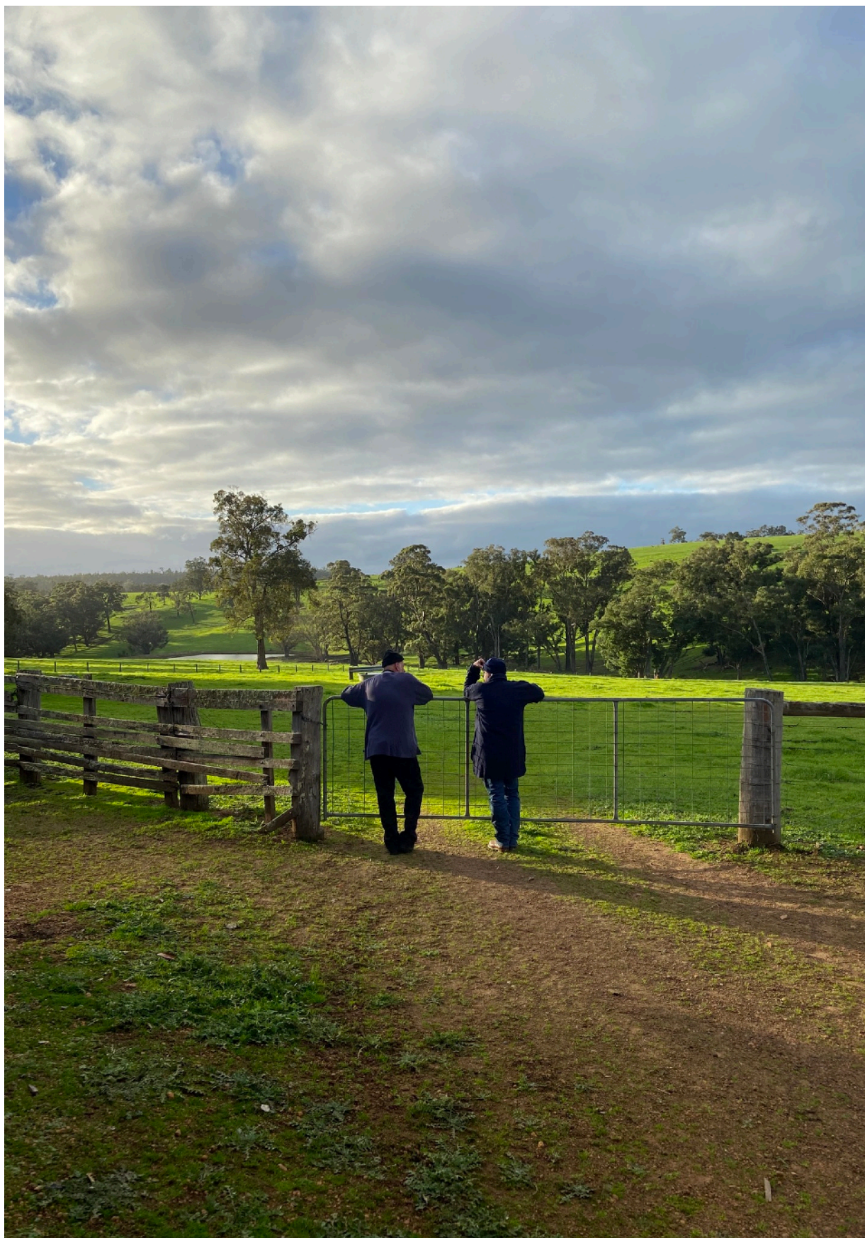
WEBBIE'S MEMORIAL RUN