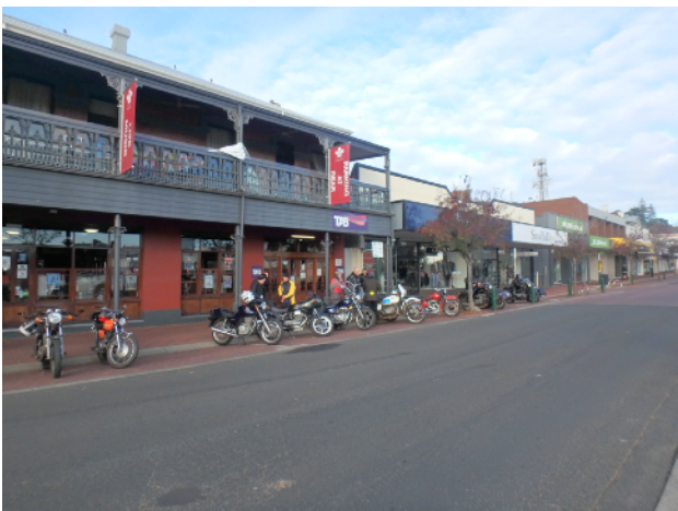
BRASS MONKEY RUN

Welcome Confirmation of June minutes Correspondence Reports General Business Close