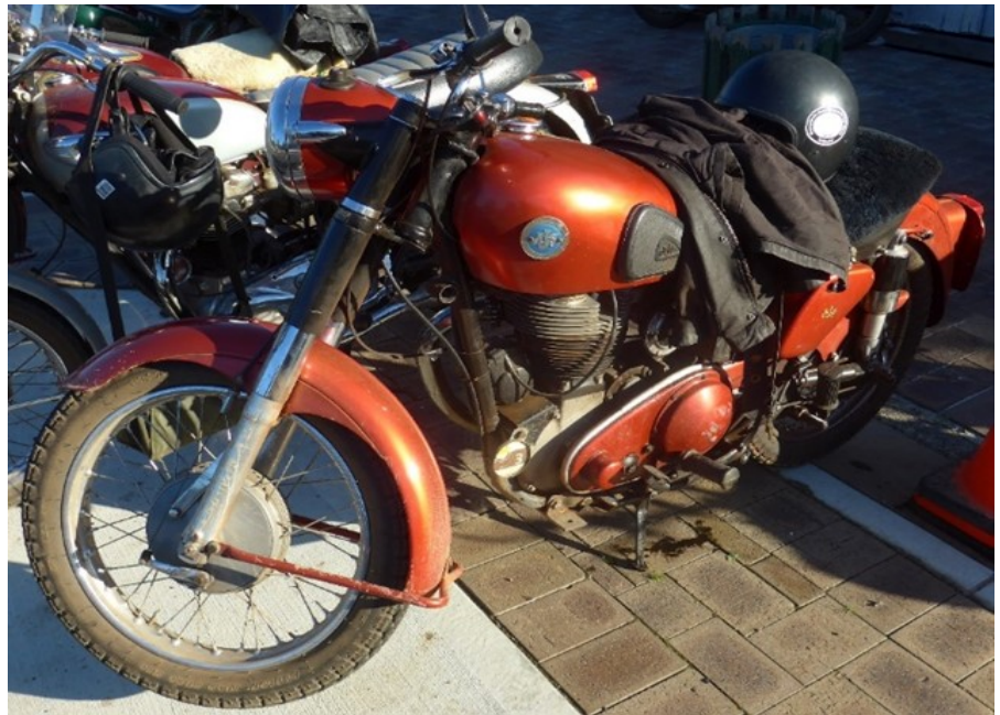
Roon's AJS had a faultless run