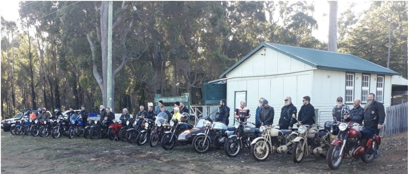
Morning at Warren Tennis Club rooms – overnight camp