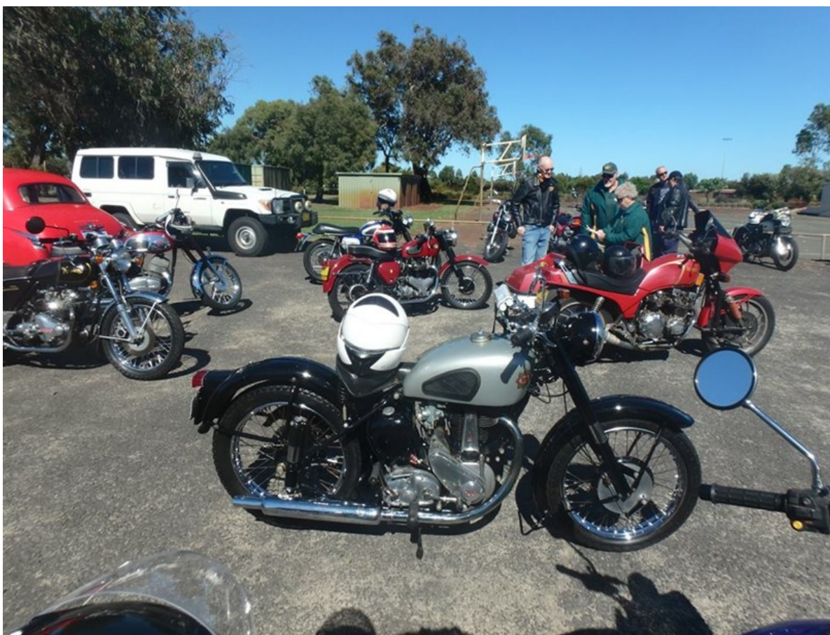
Some of our members and their machines on our recent memorial run.