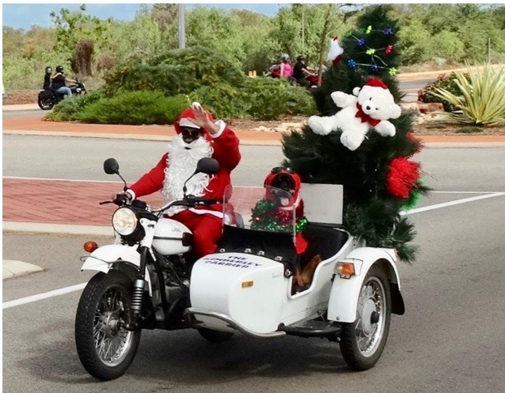
Father Christmas out and about braving the Kimberley heat in the recent 2017 Broome Motorcycle Enthusiasts Toy Run

Registered by Australia Post Print Post Approved PP631 937/016 If undelivered return to Indian Harley Club (Bunbury) Inc. PO BOX 317 BUNBURY WA 6231