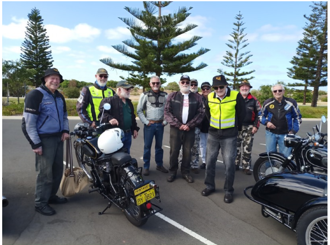
HAPPY TORTOISE RIDERS!

17 riders & one passenger turned up to the Eaton Hall on a fine day with pleasant temperatures for riding. The plan was to link up with the Tortoise Ride in Capel for morning tea.