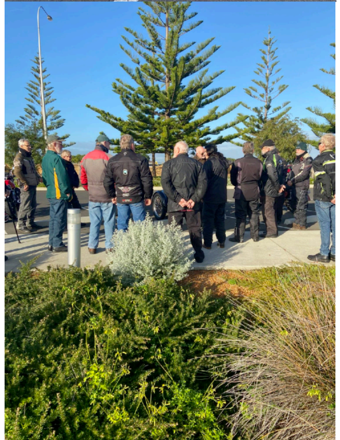
TORTOISE RIDE 16TH JULY