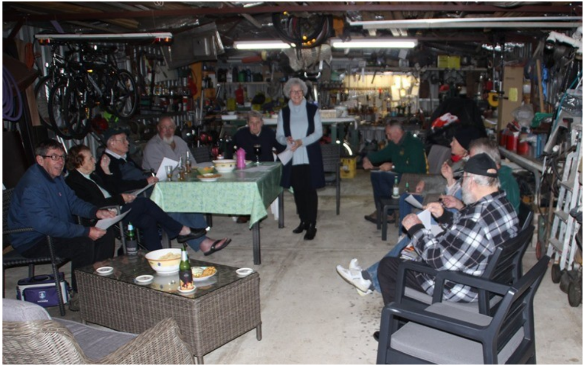
Mandurah Mob July 2019 Meeting