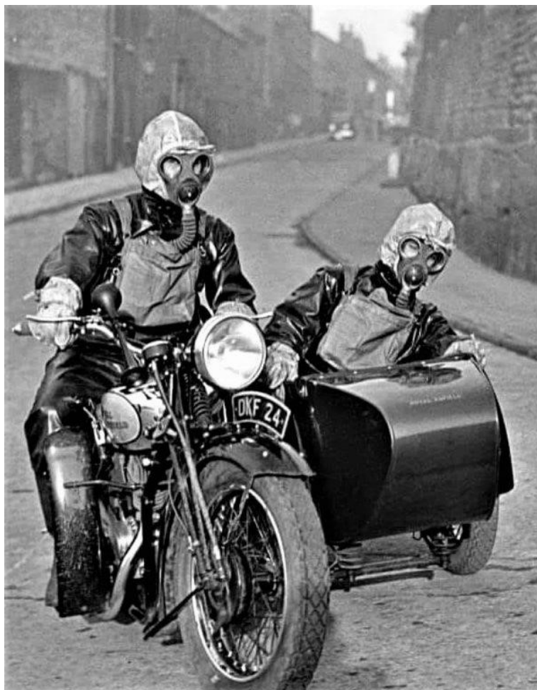
UK 1938 Liverpool City Police