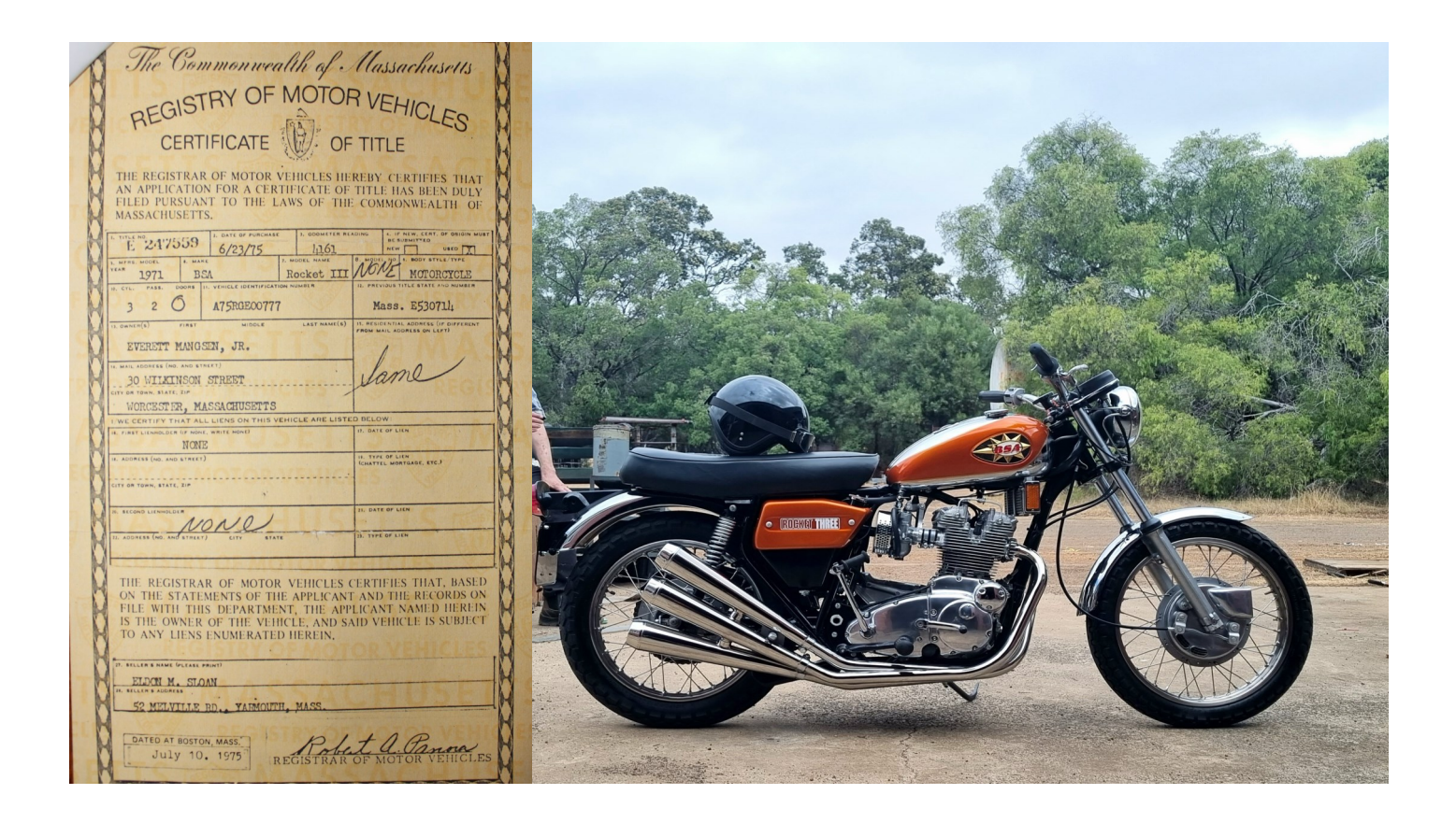
1971 BSA Rocket III 750cc restored by Dan Talbot